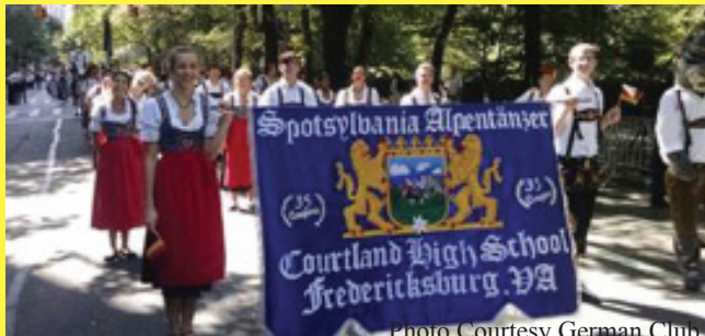
Courtland High School German Students Parade down 5th Avenue in Central Park, NYC.

CHS students and faculty wasted no time in making sure the 2016-2017 year went off without a hitch. Kicking off the year students engaged in fun activities, taking place both in and out of school.